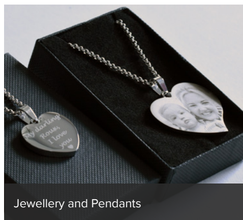
Jewellery and Pendants