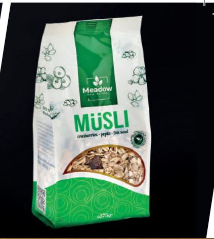
LEC2-330: IDEAL FOR REALISTIC PACKAGING MOCK-UPS & PREMIUM LABELS