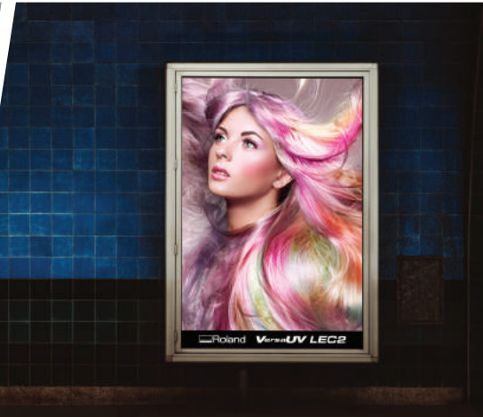
LEC2-640: IDEAL FOR EXQUISITE, HIGH-END DISPLAYS AND GRAPHICS