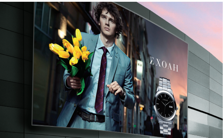
New Light Black Ink Delivers neutral grays, smooth gradations and natural skintones