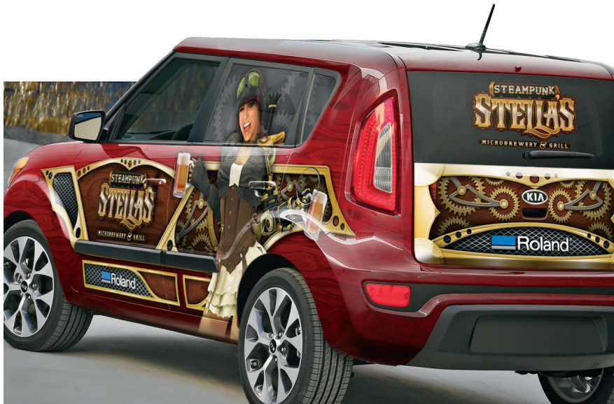
Metallic Silver Ink Produces over 500 striking metallic and pearlescent colors