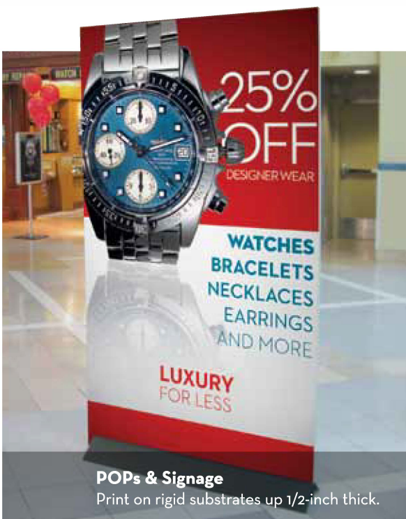
POPs & Signage