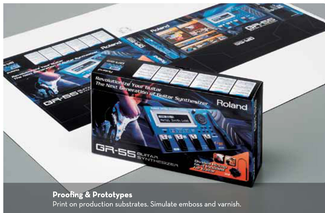
Proofing & Prototypes

Print on rigid substrates up to 1/2-inch thick.