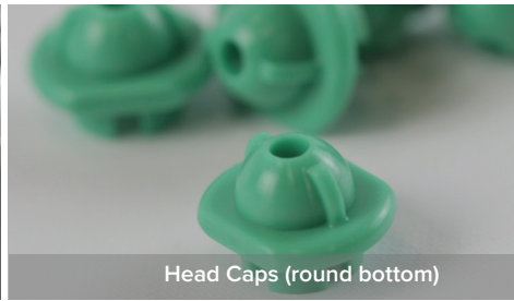
Head Caps (round bottom)