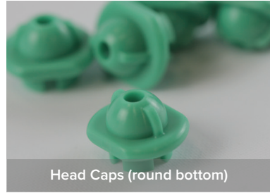
Head Caps (round bottom)