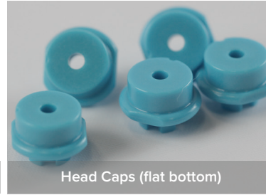
Head Caps (flat bottom)