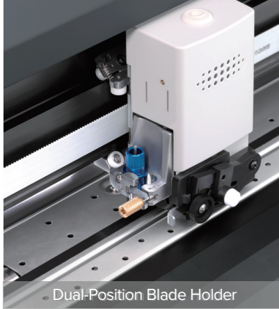
Dual-Position Blade Holder