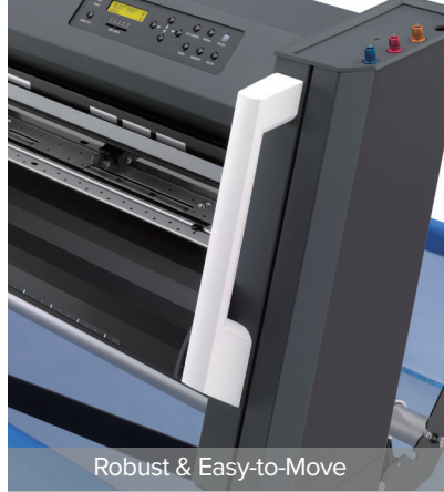
Robust & Easy-to-Move