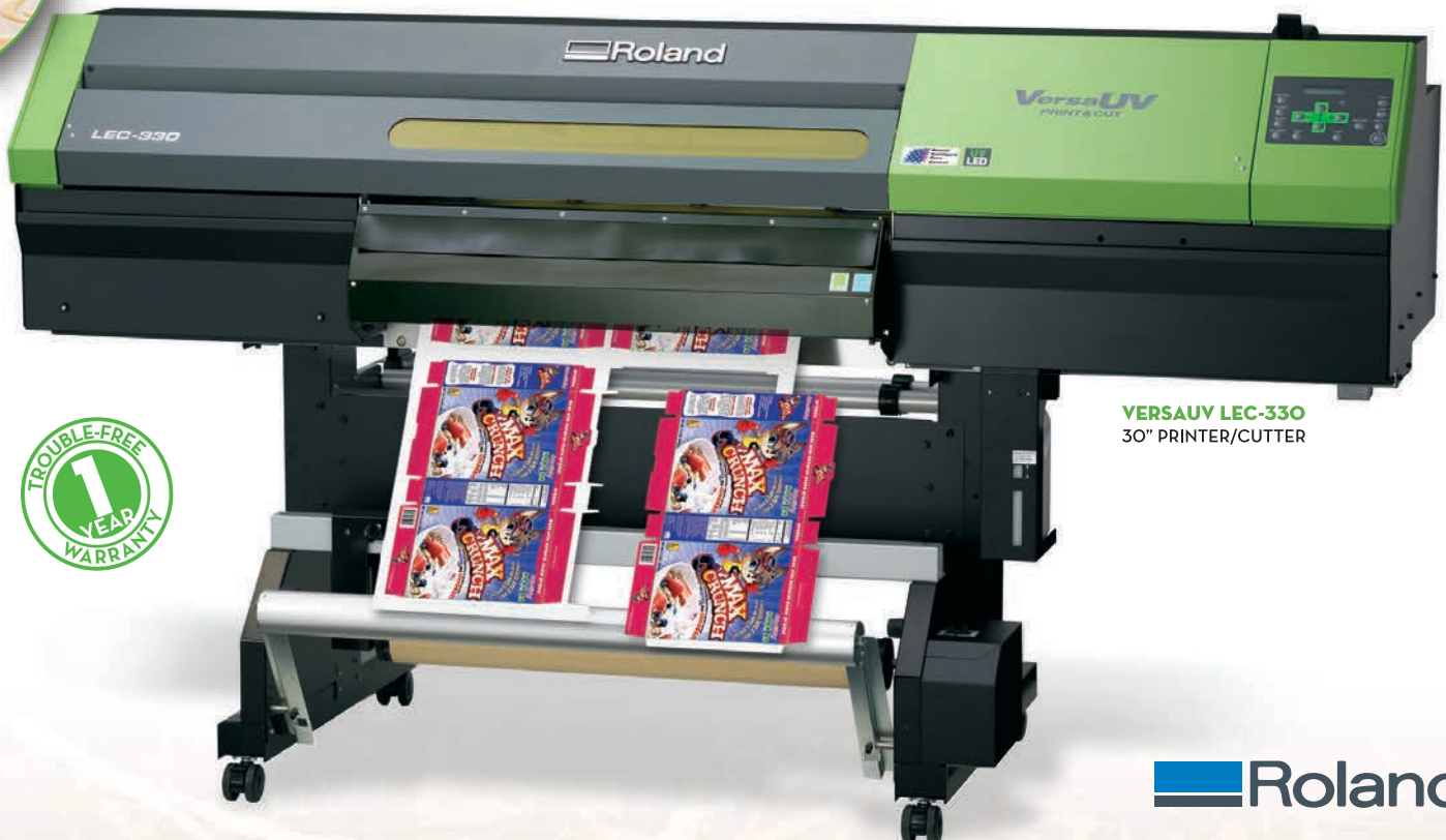
VERSAUV LEC-330 30" PRINTER/CUTTER

Folding carton prototypes in minutes, not hours.