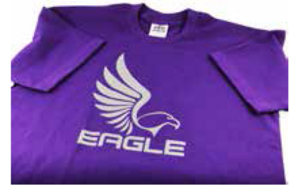
VersaSTUDIO BT-12 direct-to-garment printer

*Fabric must have a cotton blend ratio of at least 50%.