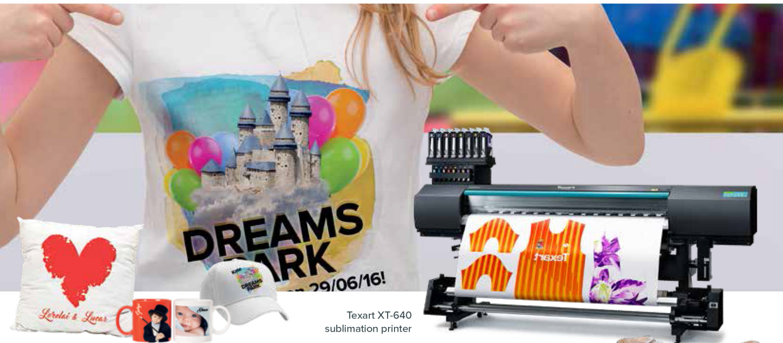
Texart XT-640 sublimation printer