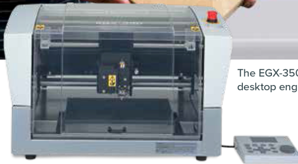
The EGX-350 desktop engraver