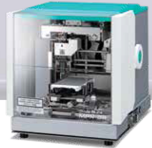
The METAZA MPX-95 desktop impact engraver