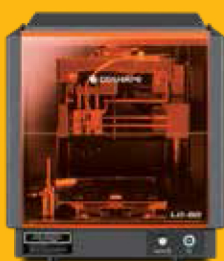
The LD-80 laser foil decorator

With your Roland engraver or impact printer you can quickly and easily add inscriptions, logos, graphics and images to a wide variety of surfaces – transforming ordinary items into one-of-a-kind keepsakes your customers will love.