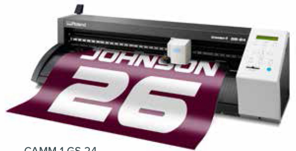
CAMM-1 GS-24 desktop cutter

With Roland DG technology you can quickly and easily print and contour cut full colour heat transfers for short run apparel, to create custom garments such as shirts, jackets and hats, plus all kinds of sportswear with heat applied digital cut graphics, including flock, reflective, neon, glitter and twill.