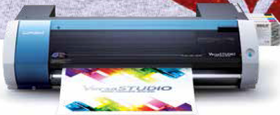
The VersaSTUDIO BN-20 desktop printer/cutter

With print widths ranging from 515mm up to 1615mm, you can also produce custom window and wall graphics, and unique contour cut labels and decals in virtually any shape or size.