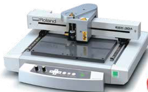
The EGX-30A desktop engraver

Roland DG's range of engraving machines and impact printers are cost effective, easy-to-use and enable personalisation onto a range of items, which is key to increasing profit.